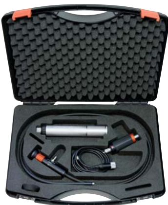
Flexible Endoscope Brightness at a distance of 16 mm